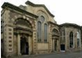
The Blakehay Centre

Following the huge success of last year's Festival, we have moved on to our next exciting project - yet another first for Weston! On Saturday 21 st March we are launching Green Talk@The Blakehay a day of inspiring talks and information at the Blakehay Centre in Wadham Street, Weston-super-Mare