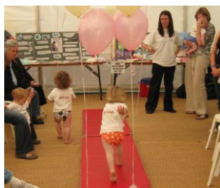
Nappy Cat Walk Show

Nearly 3 billion nappies are thrown away in the UK every year. The vast majority of these (90%) end up in landfill. It could take hundreds of years for the plastics in disposable nappies to decompose.